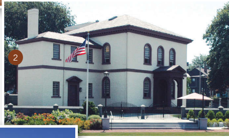
2 Touro Synagogue