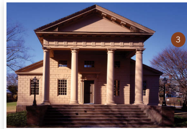
3 The Redwood Library & Athenæum