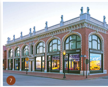
7 Audrain Automobile Museum