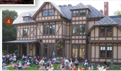
4 Newport Art Museum