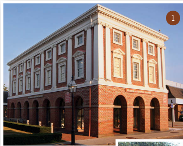
1 Museum of Newport History & Shop at the Brick Market