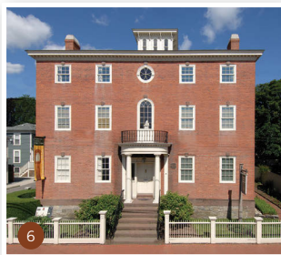
6 Whitehorne House Museum